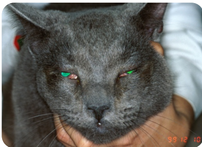
Entropion in both eyes in a cat

When entropion develops in puppies under 4 months of age, a permanent surgery is not usually the best treatment option. As puppies grow, the severity of the entropion may significantly lessen or they may not need a surgical procedure at all. In young puppies, the recommended treatment is a temporary tacking of the eyelids (for three to six weeks) to prevent them from rolling inward. The temporary tacking will sometimes prevent the need for a permanent surgical procedure in the future or minimize the surgical correction necessary to resolve the entropion. Once the puppy is fully grown (8 to 12 months), we would re-evaluate the need for surgery and make recommendations at that time.