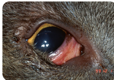
Details of entropion in the same cat (right eye)