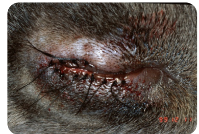
Same right eye just after surgery