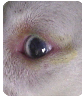
Immune mediated blepharitis in a dog