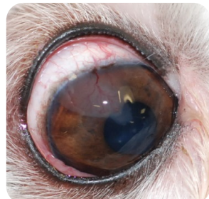
Examples of 2 eyes with NGE